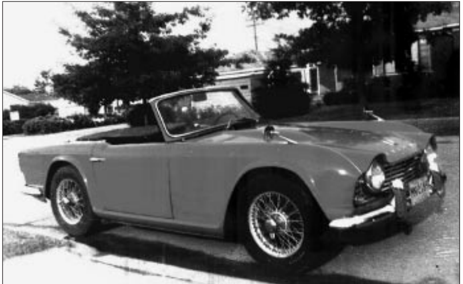
It took just one night of driving for Mike Simon to learn to smoothly shift his 1963 TR4.

In 1965, just prior to graduating from high school, I started looking for a good, used Triumph TR-4 in the want ads. We found one at a used car dealer on the west side of town, a red 1963 TR-4, black