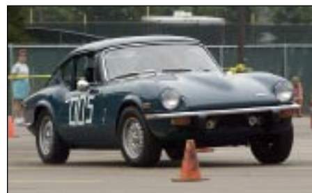
Sue Snyder: First in class, autocross