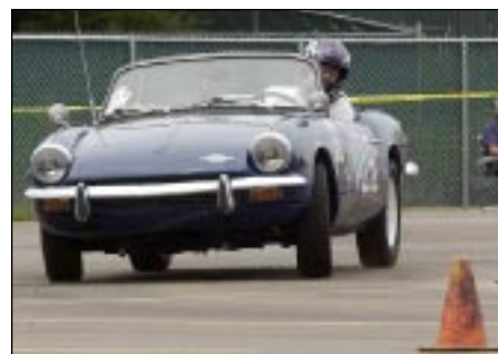
Pat Barber: First in class, autocross