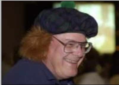
GOIN TO WAMBO? This 'Scotsman' wants you to go with him! Page 3