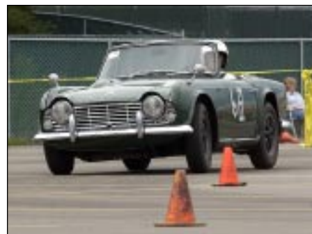
Alan Sheets: Third in class, autocross